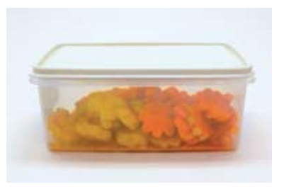
Store food in tightly sealed containers.