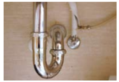
Plumbing leaks and damp basements can be an essential source of water for insects. Get rid of the moisture, and you could solve your bug problem.